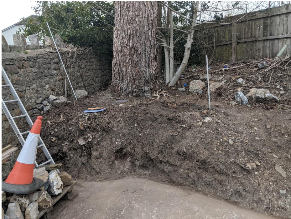
IMAGE4 (below): Ground conditions around the tree. Note that there is little rooting to the south which is where the impact of on-short winds would be.

IMAGE3 (above) The trees viewed from below The Lodge.