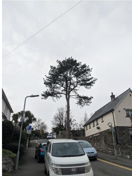
IMAGE3 (above) The trees viewed from below The Lodge.

IMAGE4 (below): Ground conditions around the tree. Note that there is little rooting to the south which is where the impact of on-short winds would be.