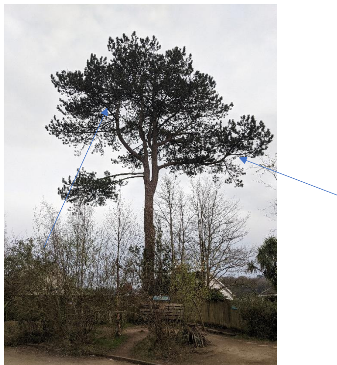
IMAGE 2 (below): The tree viewed from within the school grounds. The left arrow shows a hung-up branch, the right arrow shows where the branch broke that landed in The Lodge.