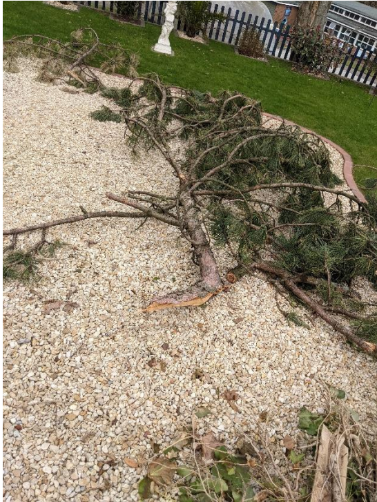
Above & Below: Two views of the branch which broke and landed in The Lodge.