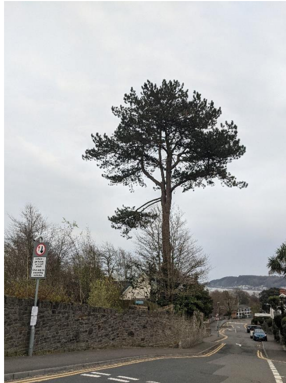
IMAGE 1 (above) The tree viewed from up the hill, opposite the school.